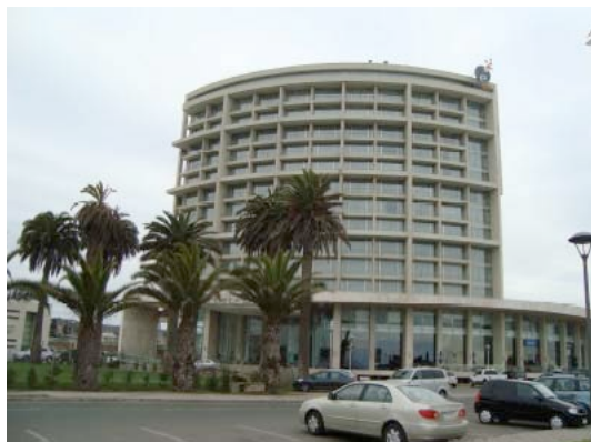
HOTEL DE LA BAHÍA, (Hotel Enjoy Coquimbo), La Serena-Coquimbo, Chile, site of the XLV ONTA Annual Meeting.