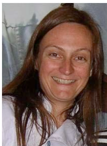
Paola Lax Distinguished Service Award